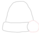
Trace it! 3