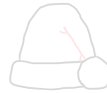
Trace it! 4