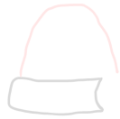
Trace it! 2