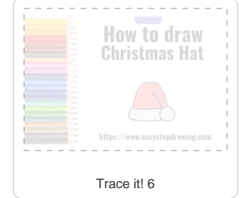
Trace it! 6