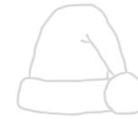
Trace it! 5