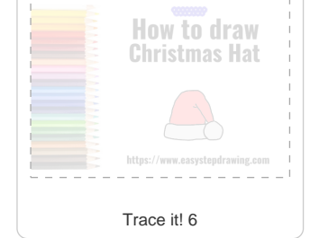
Trace it! 6