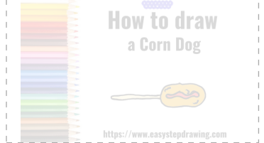
Trace it! 5