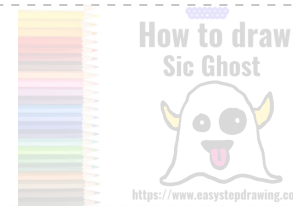
Trace it! 8