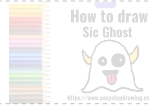
Trace it! 8