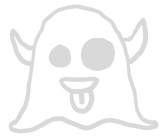
Trace it! 7